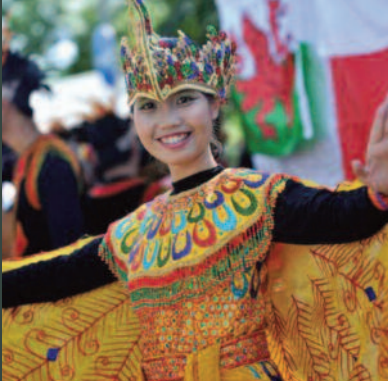
Llangollen International Eisteddfod