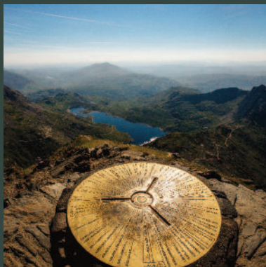
International Snowdon Race