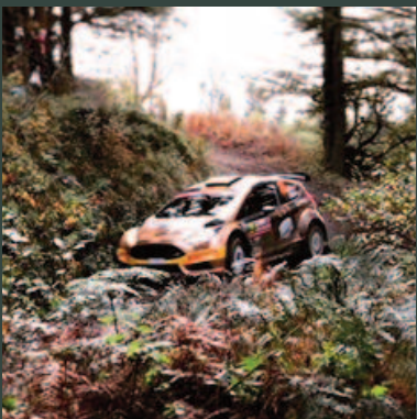
Wales Rally GB