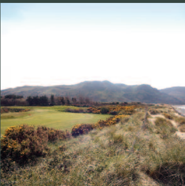
The Curtis Cup